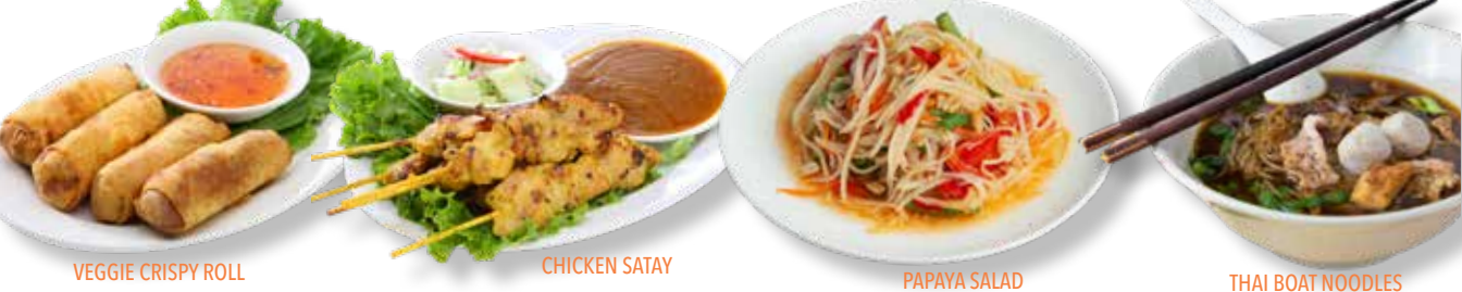
VEGGIE CRISPY ROLL