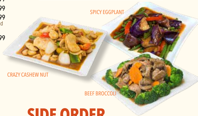
CRAZY CASHEW NUT

PRSR STD ECRWSS U.S. POSTAGE PAID EDDM RETAIL