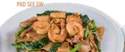
PAD SEE EW