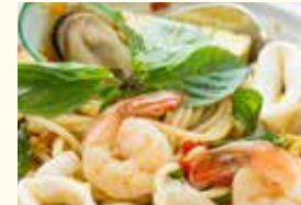
SPAGHETTI THAI BASIL